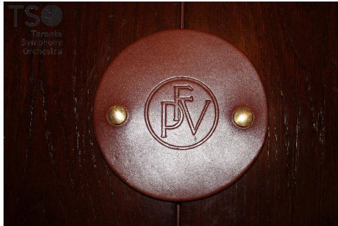
LOT 1 – A rare mahogany case of 12 wines from the Primum Familiae Vini [PFV].