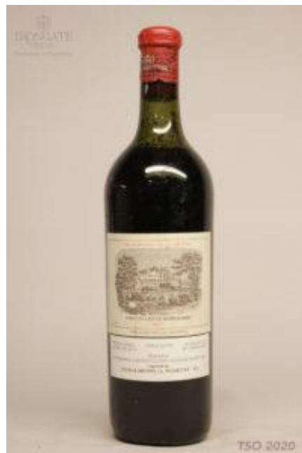
LOT 63 – 1869 Château Lafite Rothschild

2020 TSO Fine Wine Auction – view the online catalogue at: IronGateAuctions.com